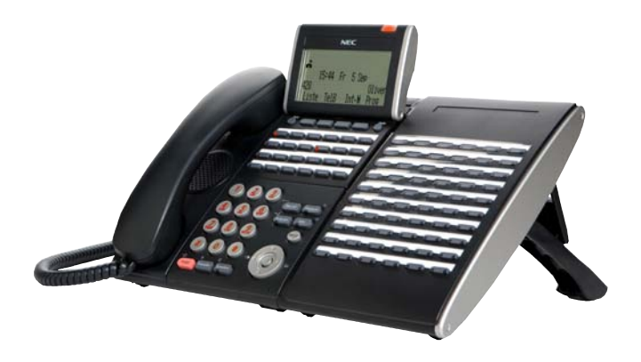
DT330 Digital terminal - with 60 DSS console