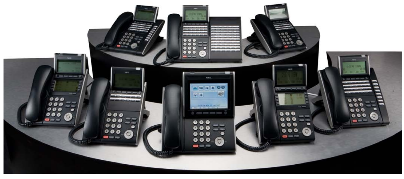
Top row: DT730 IP terminal (32 line keys), DT330 Digital terminal with DSS console, DT730 IP terminal (24 line keys) Bottom row: DT730 IP terminal DESI-less, DT330 Digital terminal (12 line keys), DT750 IP terminal with colour touch screen LCD, DT330 Digital terminal DESI-less, DT330 Digital terminal (32 line keys)

UNIVERGE®360 is NEC's approach to unifying business communications. It places people at the center of communications and delivers on an organization's needs by uniting infrastructure, communications and business.