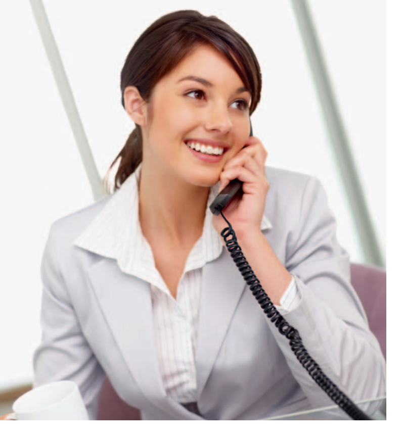
No matter your business size, NEC's UNIVERGE family of IP and digital terminals provides you with the right solution to meet your needs, now and in the future.