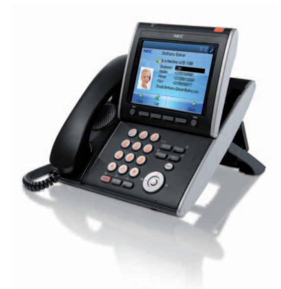
DT750 IP Terminal with colour touch screen LCD

Users can log on to any IP terminal anywhere on the business's NEC network. Upon logon, the user's profile and quality of service settings are immediately available to him or her. There is no need for extra programming.