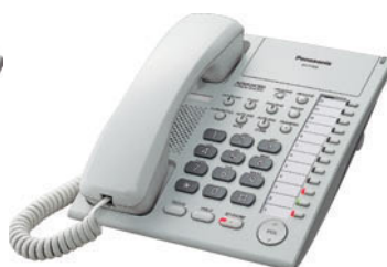
■ KX-T7720 Speakerphone Unit