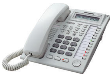
■ KX-T7730 LCD, Speakerphone Unit