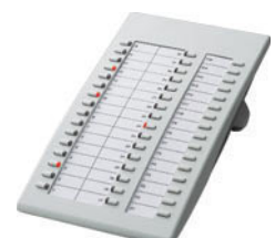
■ KX-T7740 DSS Console