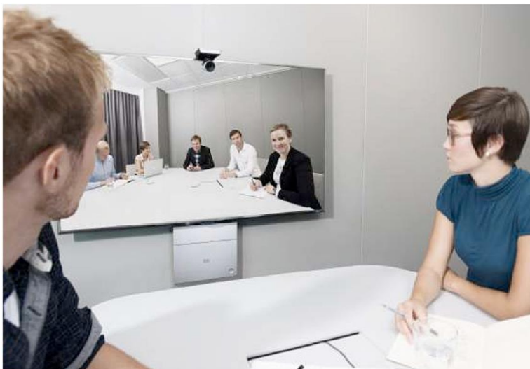
Figure 1. Cisco TelePresence SX20 Quick Set in a Small Meeting Room Environment

SX20 Quick Set combines a powerful codec, premium resolution of 1080p, three camera choices, and a dual-display feature in an easy-to-deploy and easy-to-use solution. Whether you're a small business just getting started with telepresence or a large enterprise looking to expand your existing deployment, the SX20 Quick Set delivers the performance you would expect from more expensive systems - in a compact, feature-rich and affordable package. Cisco TelePresence SX20 Quick Set is designed to truly extend the power of in-person to everyone, everywhere.